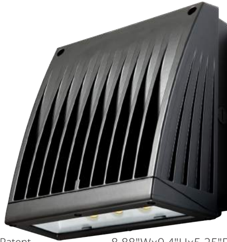
Patent Pending 8.88"Wx9.4"Hx5.25"D 7.9 LBS